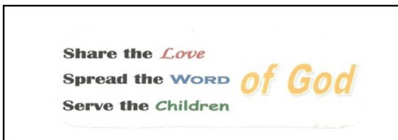
Proposed Mission Statement No. 1: